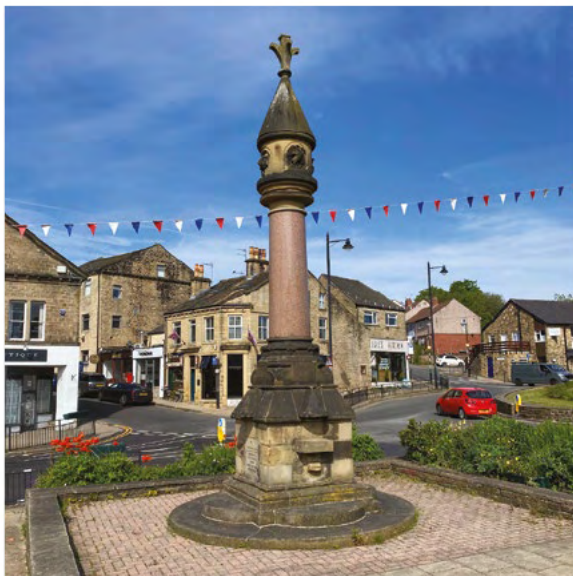
The Potted Meat Stick in the centre of Baildon

Baildon can offer you many good cafes and pubs where you will find that walkers are welcome. Public toilets are located on Northgate (thanks to Baildon Town Council for saving these public toilets). There are also toilets at Bracken Hall Countryside Centre and Wesleys at Baildon Methodist Church when these venues are open. All have an accessible toilet.